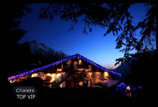
Chalets TOP VIP

700 route du Chapeau – Le Lavancher 74400 Chamonix Mont-Blanc Tél. 00 33 (0)6 07 23 17 26 - Fax 00 33 (0)4 50 54 08 28 Contact : Philippe COURTINES ultimateluxuryfullyservicedchalets.com Email : contact@chaletsphilippe.com